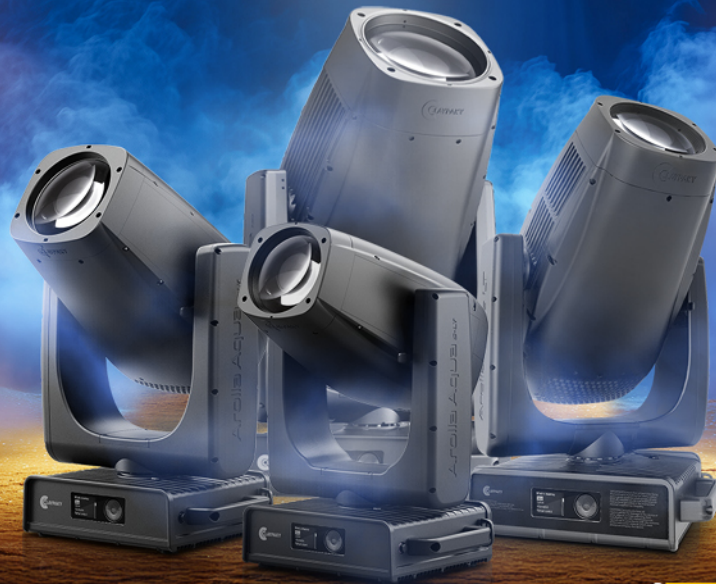
Arollā Aqua MLT

Four long-throw profile fixtures that redefine what power, precision, and protection mean on stage.